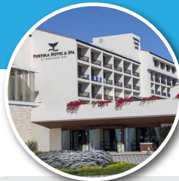
Portola Hotel & Spa

Each year, the California Resource Recovery Association organizes one of the most comprehensive and informative conferences dedicated to recycling and sustainable materials management in California and beyond. The Annual Conference and Trade Show attracts over 800 individuals annually and showcases an estimated 30 sessions each year with over 100 industry experts as presenters.