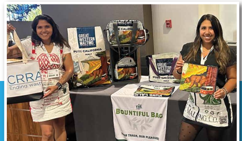
Innovative Exhibit Hall