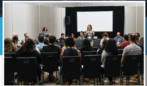
Growth and Development