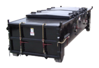
Steel split lid