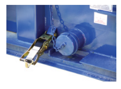
Drains and valves can be custom configured.