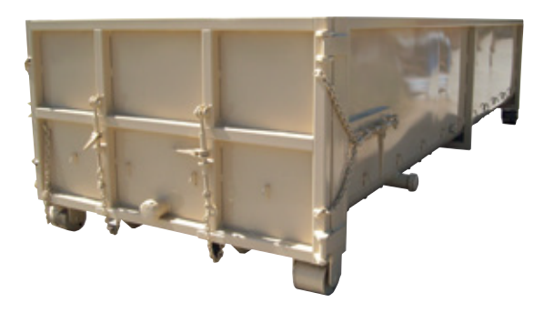
Round bottom model