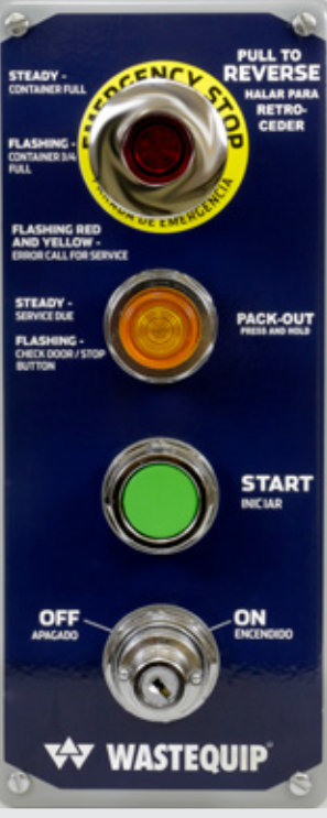
Easy-to-use 24-volt Guardian Control System (optional remote pendant shown)