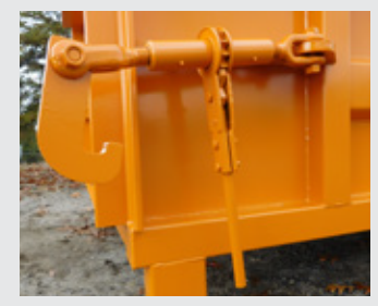
Heavy-duty ratchet binders with 1-1/4" thick hooks are standard.