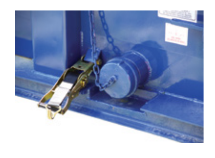
Drains and valves can be custom configured.